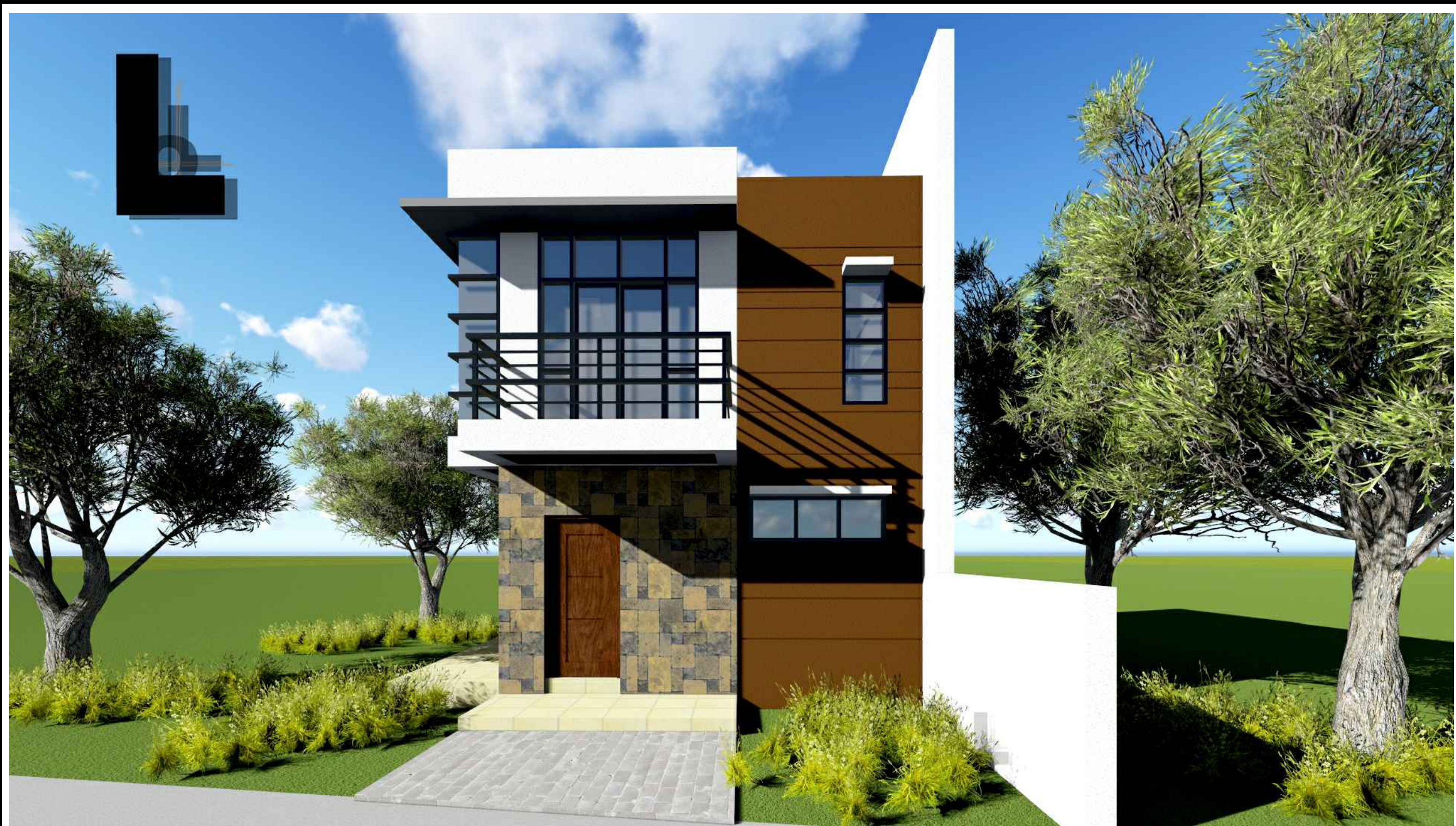
1 A 1 PERSPECTIVE 01