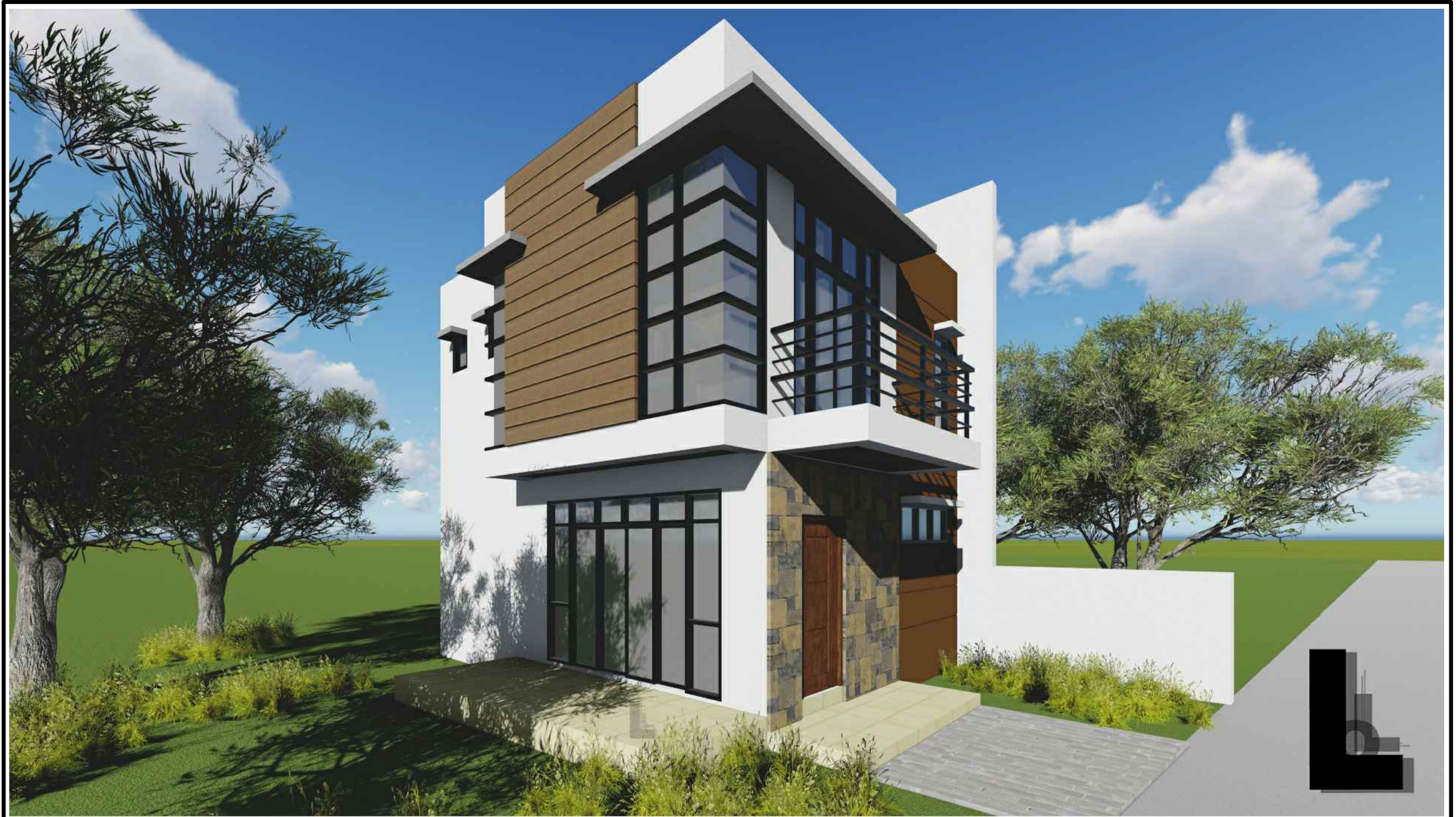
1 A 1 PERSPECTIVE 03