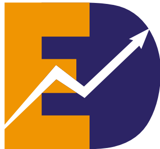
Equity Derivative Treading Academy