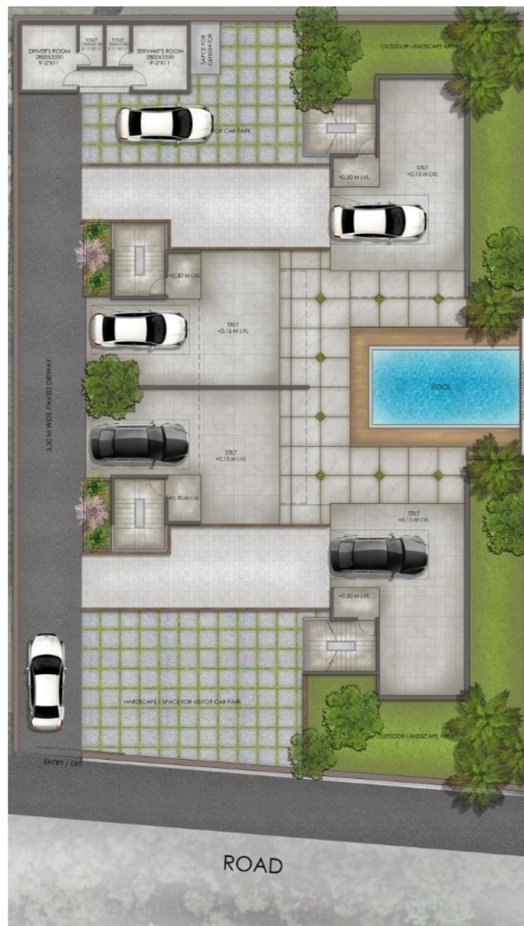
Stilt floor plan