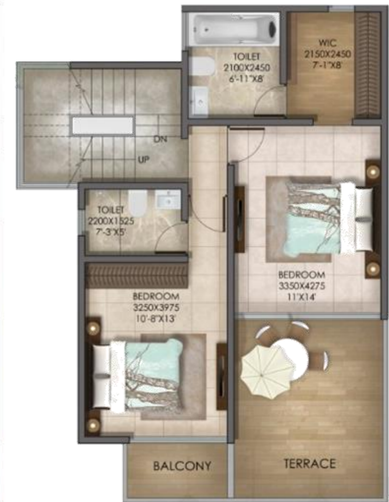
TYPE 1 2nd FLOOR

Stilt floor : staircase area = 144.73 SQ.FT.