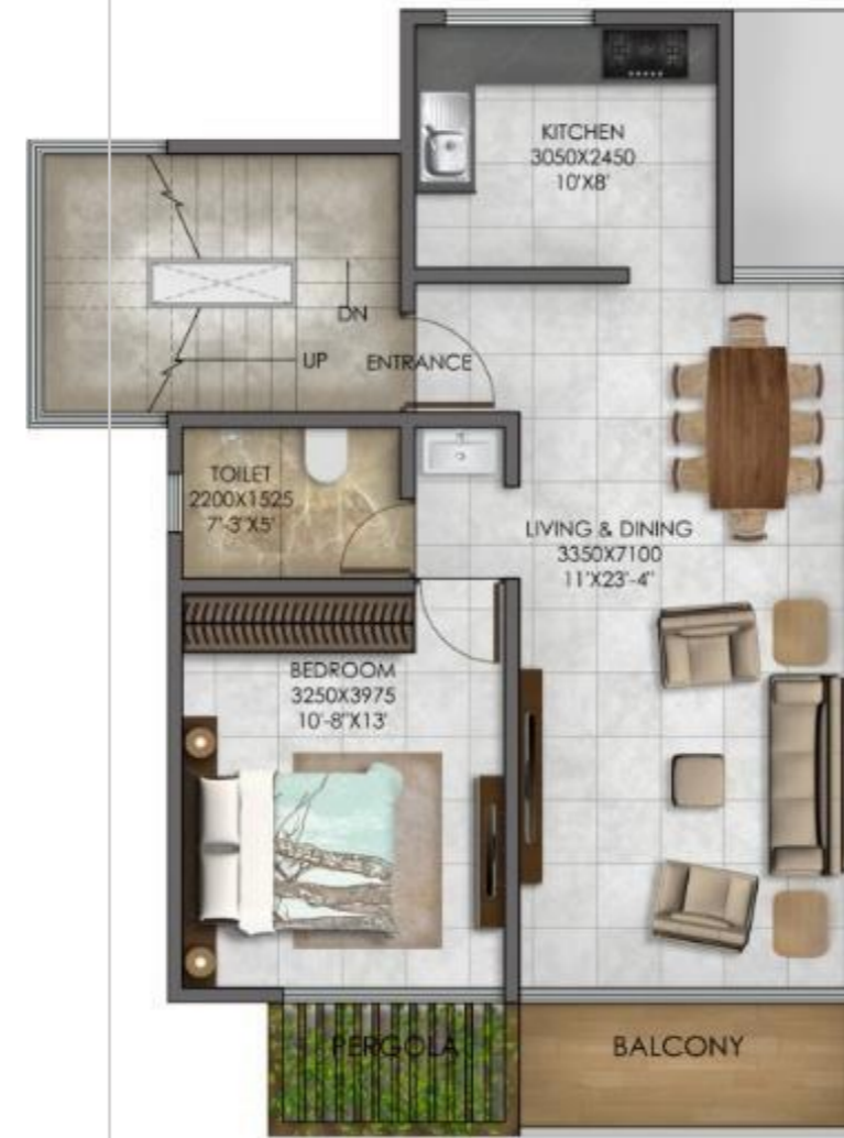
TYPE 1 1st FLOOR