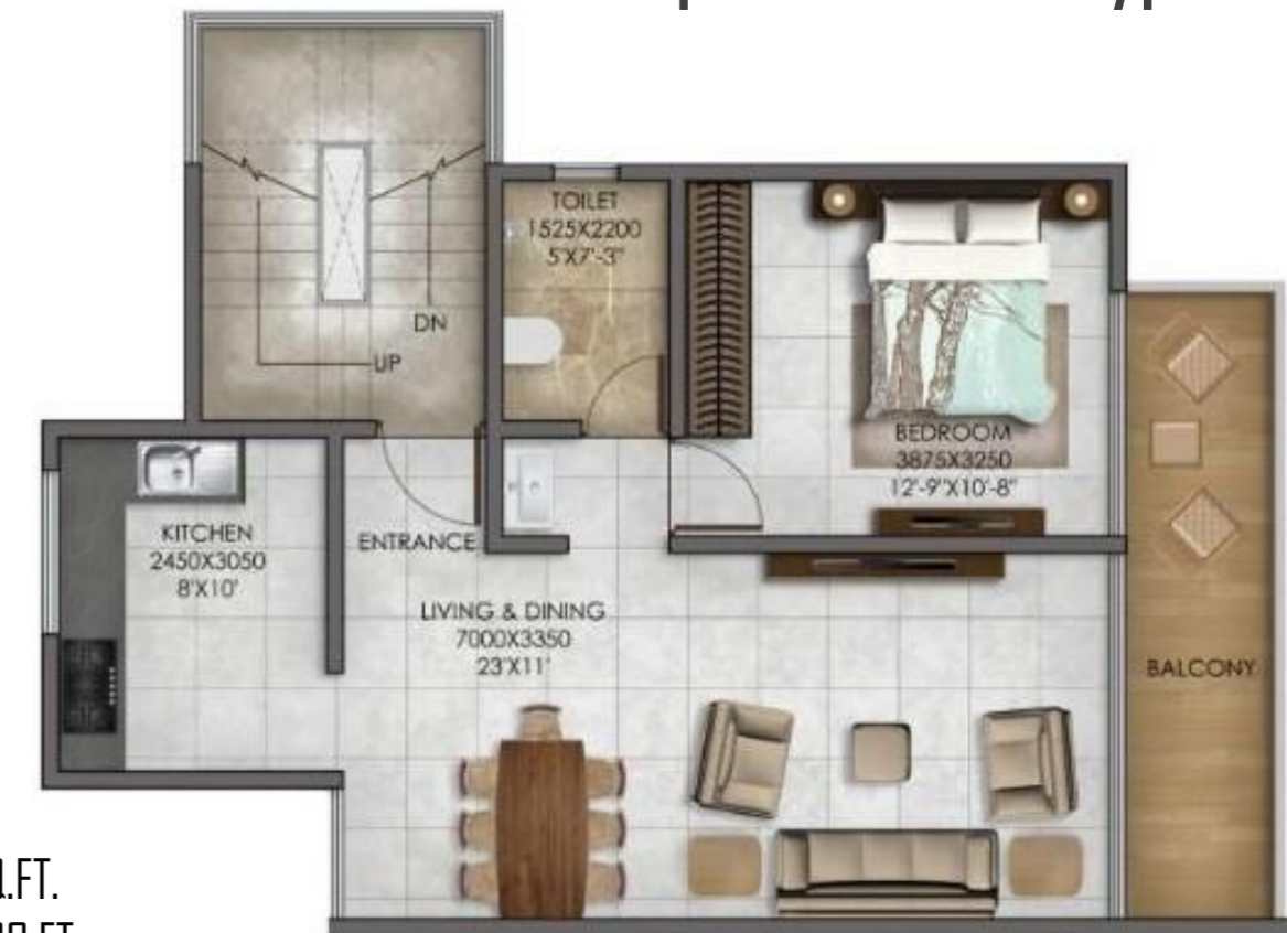
TYPE 2 1st FLOOR