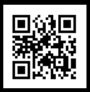
Scan the QR Code for the nutrient calculator.