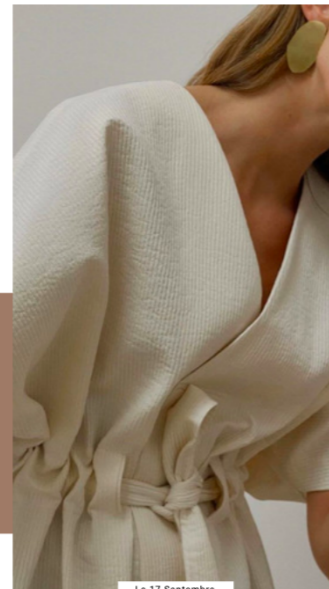
Le 17 Septembre