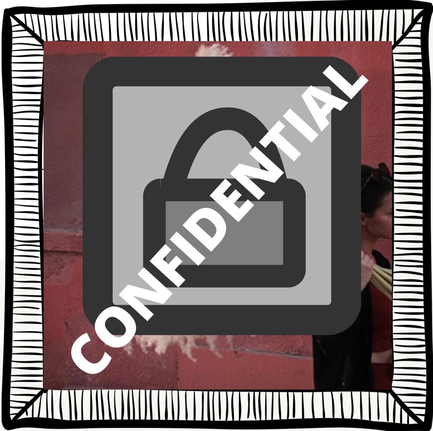
Small and Large