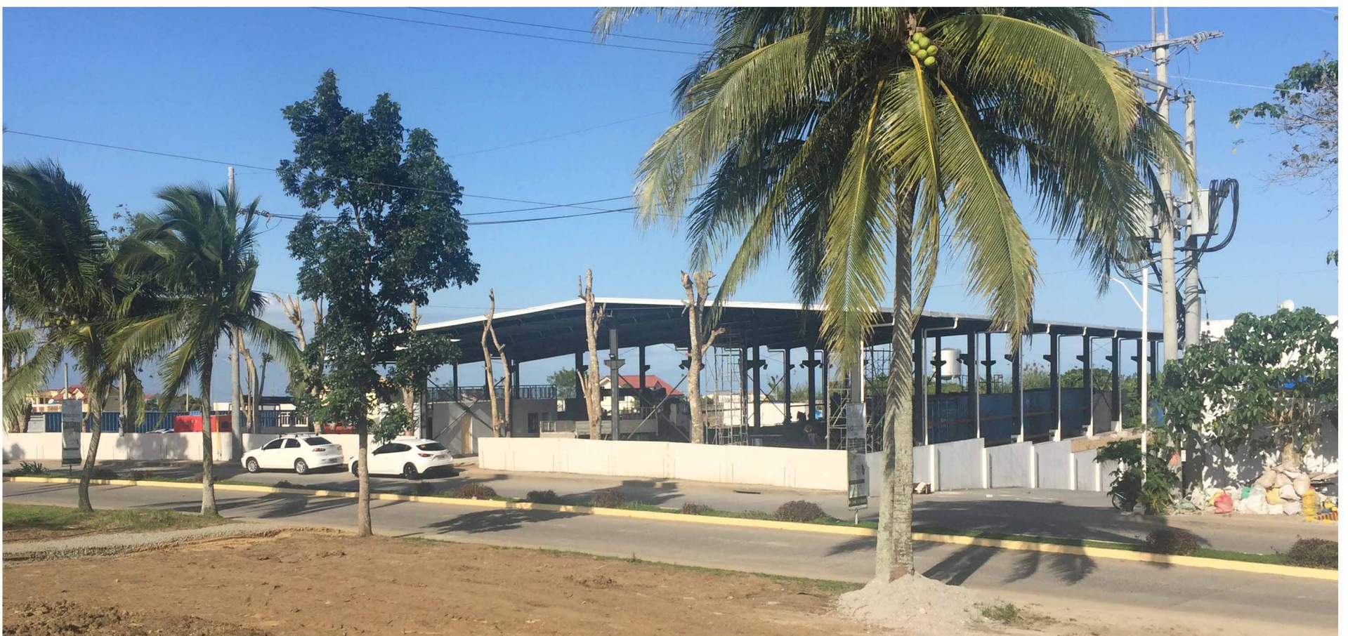
ACTUAL CONNOVATE FACTORY