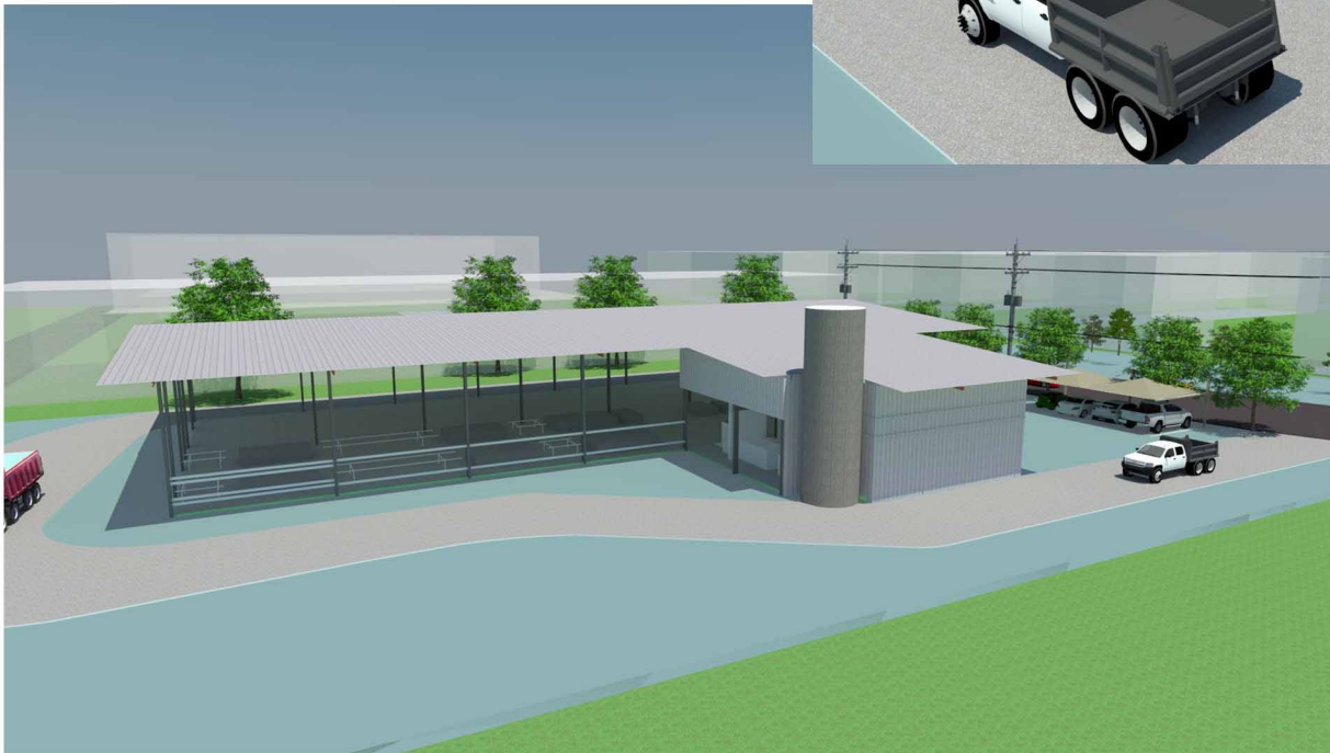
PROPOSED CONNOVATE FACTORY