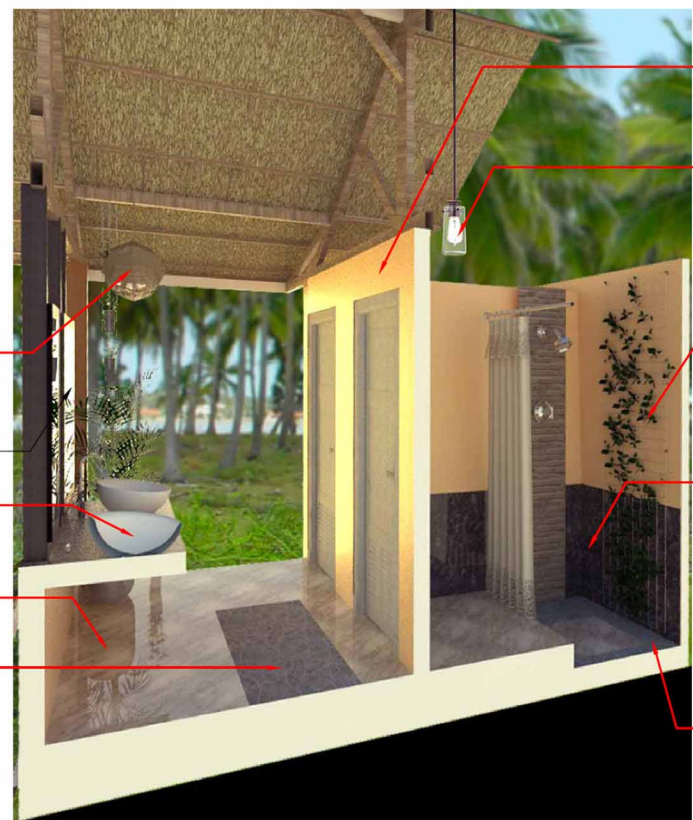
SECTIONAL PERSPECTIVE 2

ROOF FRAMING DOWN LIGHT FIXTURE HANGING INDOOR PLANTS (OPTIONAL) SHOWER HEAD STONE WALLS FROM LOCAL SHOWER CURTAIN 600mmX300mm CERAMIC WALL TILE 600mmX600mm CERAMIC FLOOR TILE PEBBLE FLOORING