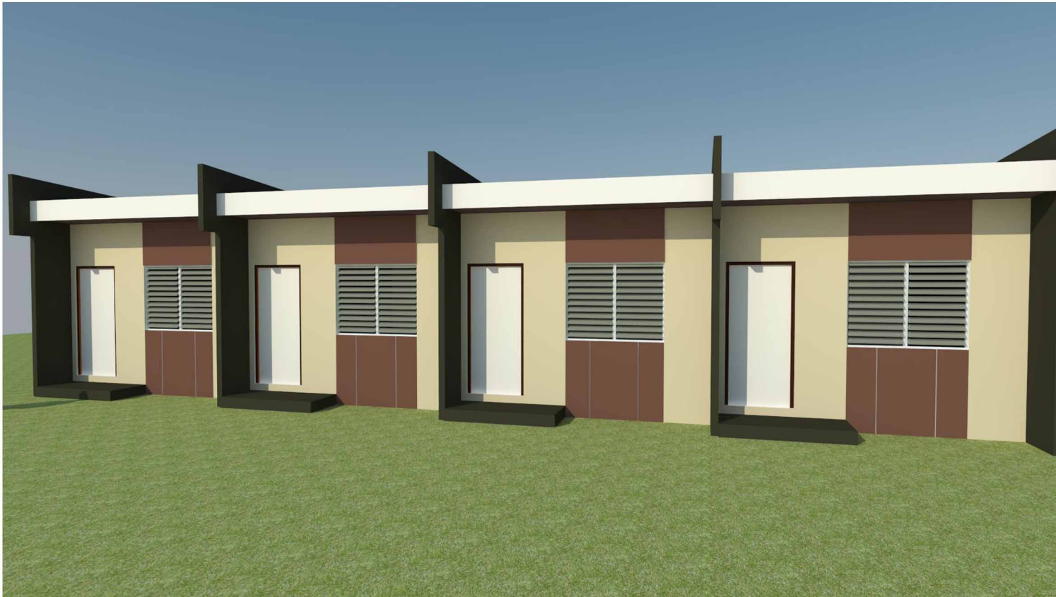
PROPOSED 1 STOREY ROWHOUSE SOCIALIZED HOUSING