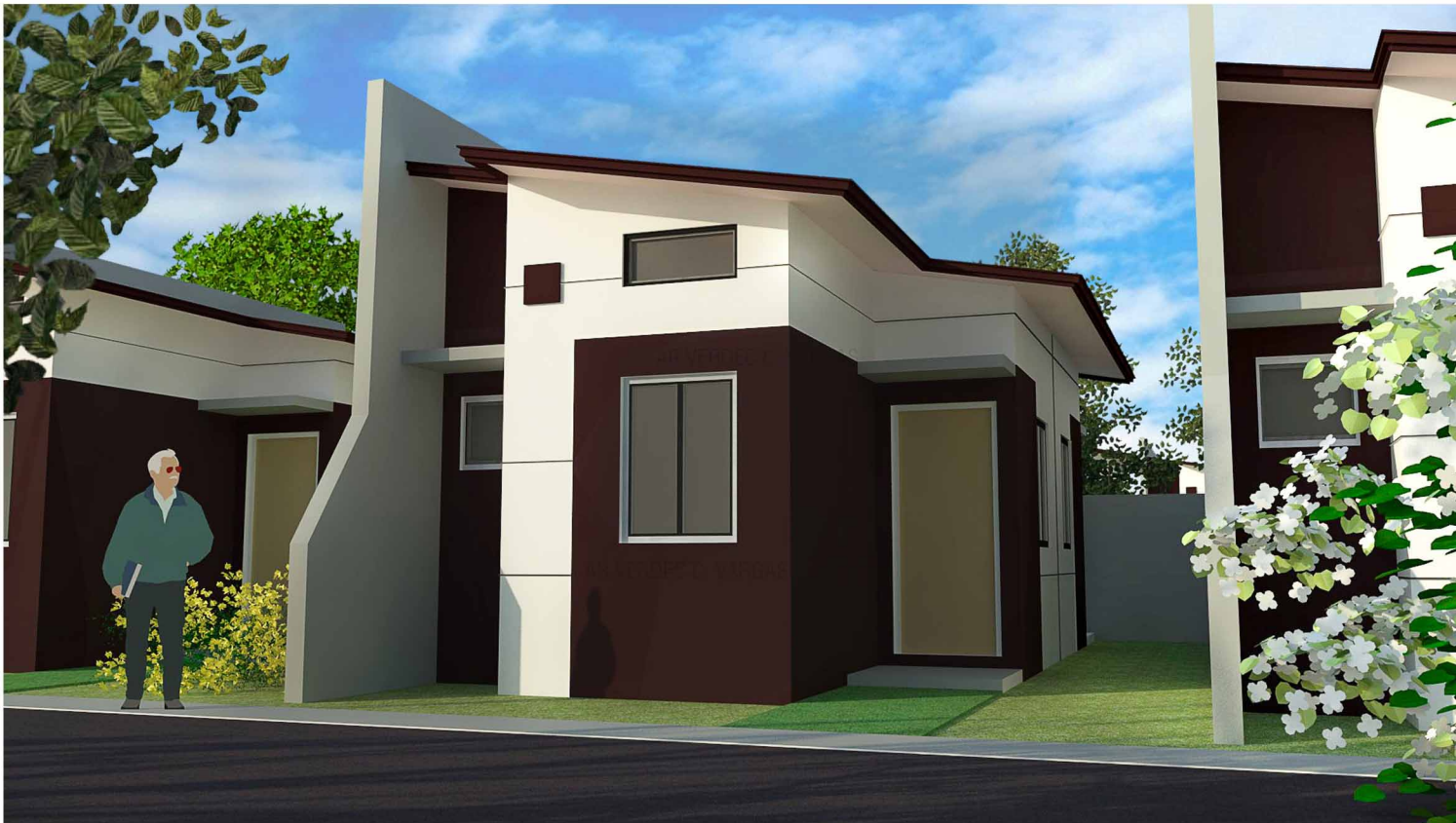
PROPOSED 1 STOREY with LOFT PROVISION 2 BEDROOM SINGLE ATTACHED ECONOMIC HOUSING