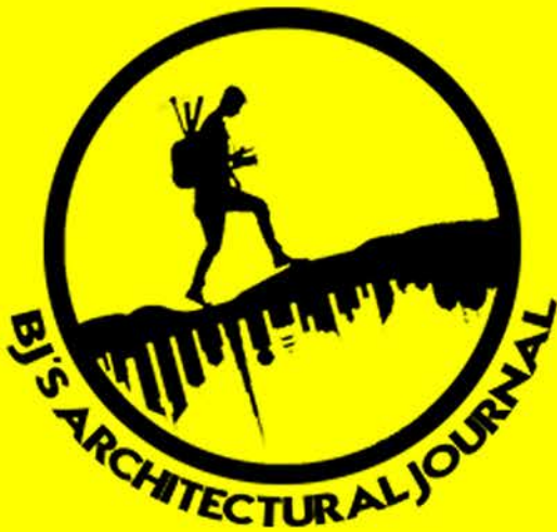
BJ'S ARCHITECTURAL JOURNAL