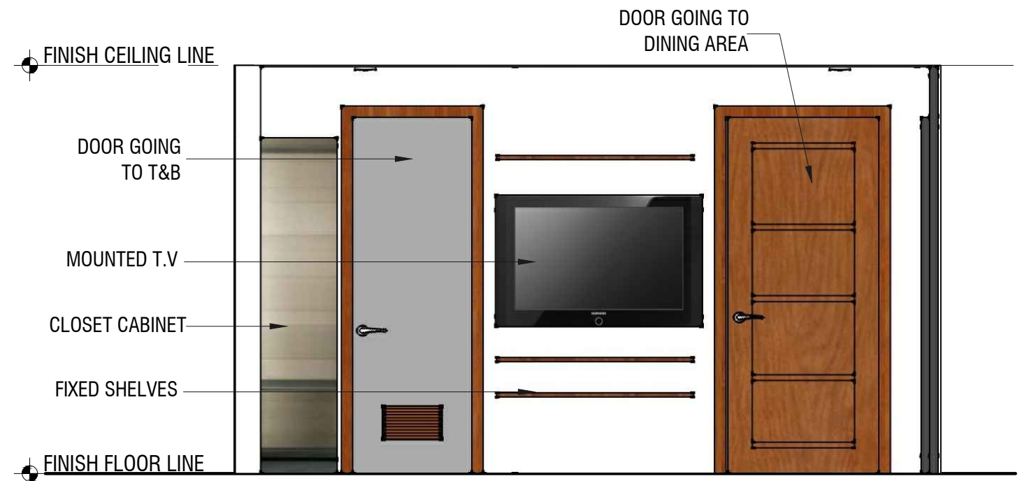
03 ELEVATION B - ADDITIONAL BEDROOM 1:50 @ Ax