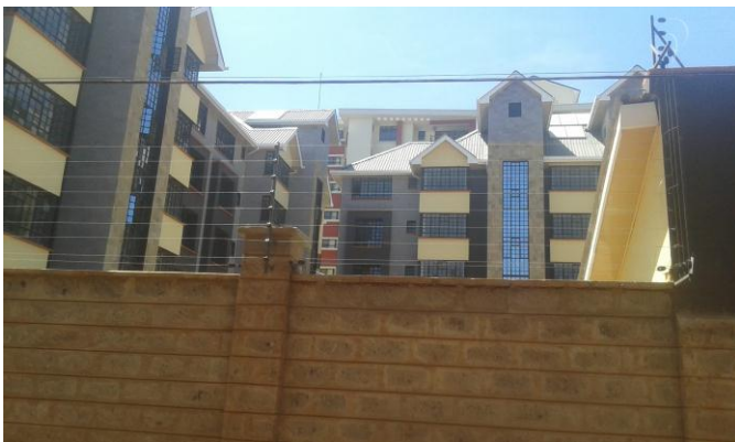
Residential development at Thindigua