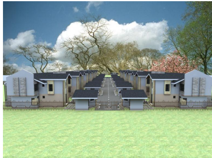
Residential development at Ruiru Dinara Developers Ltd