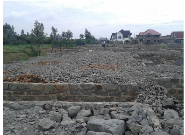
Above is a Model for Ruiru Mashariki Park