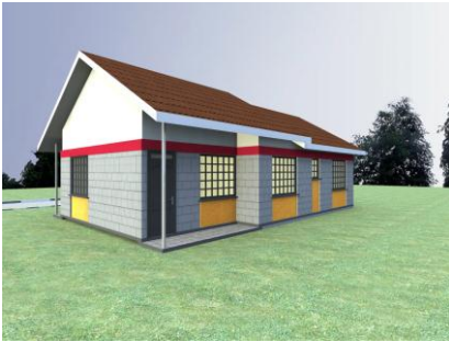
Above is Architectural design and a Model for the units while below the project on site