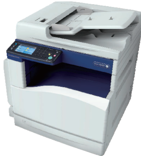
PICTURED ABOVE: DocuCentre SC2020 with STANDARD 1 Tray configuration