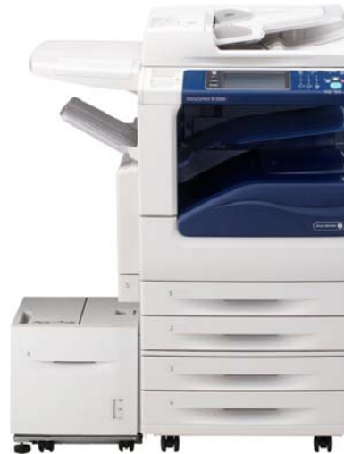
PICTURED ABOVE: DocuCentre-IV 2060 with OPTIONAL Wing Table and High Capacity