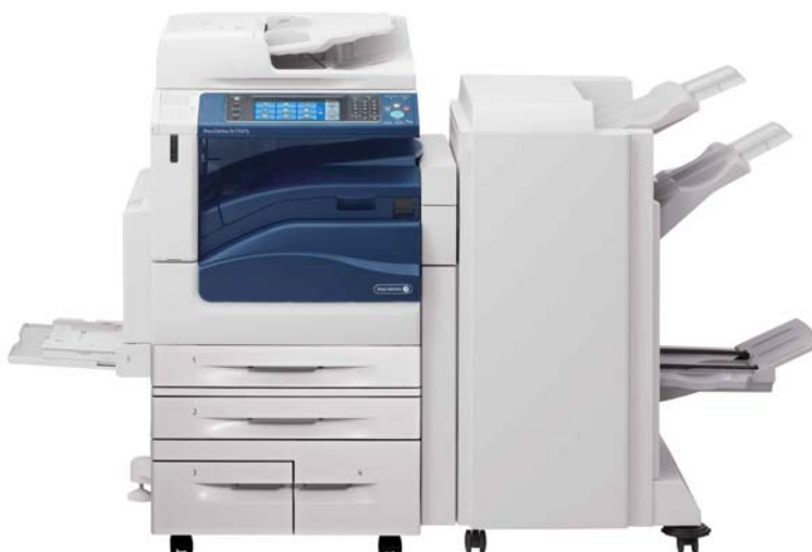
PICTURED ABOVE: DocuCentre-V C5575 With OPTIONAL Booklet Finisher-C1